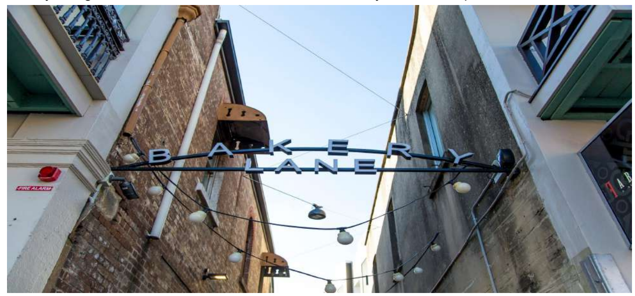
Bakery Lane in Fortitude Valley

Take a walk down Boundary Street and breathe in the suburb's positive energy and cool vibes, and before long you, too, will be obsessed with West End's enduring charm. Nearby Musgrave Park offers a beautiful location for study or a catch-up with friends.