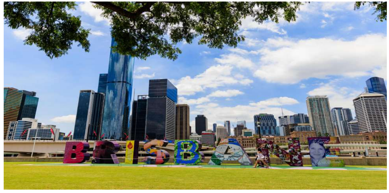
South Bank Parkland in South Brisbane

You can also enjoy panoramic city views from nearby Mt Coot-tha or, if you're an animal lover, Lone Pine Koala Sanctuary is just a short drive away.