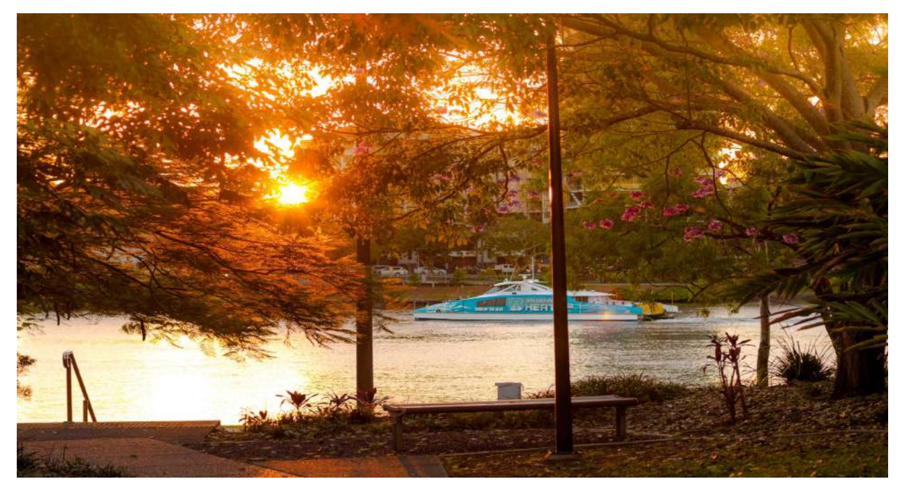
Sunset in West End