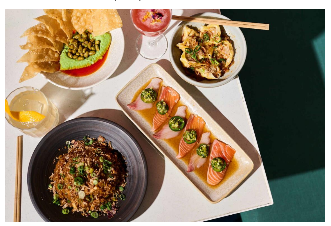
Canberra. There's more than they're telling us.

Take your time as you taste your way through the city's more than eclectic mix of cuisines, wineries and unique experiences.