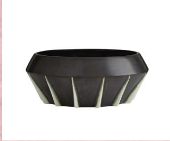
Shiloh Centrepiece Table

Your home office should be a reflection of your work personality and style. Here, we'll down the essential components of a functional and stylish home office in Canada.