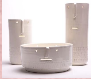
Mod Face Collection