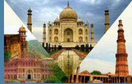
Luxury Golden Triangle Tour