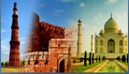
Golden Triangle India