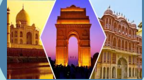
Golden Triangle Tour