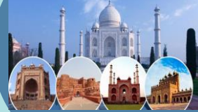
Delhi Agra Jaipur Tour Package